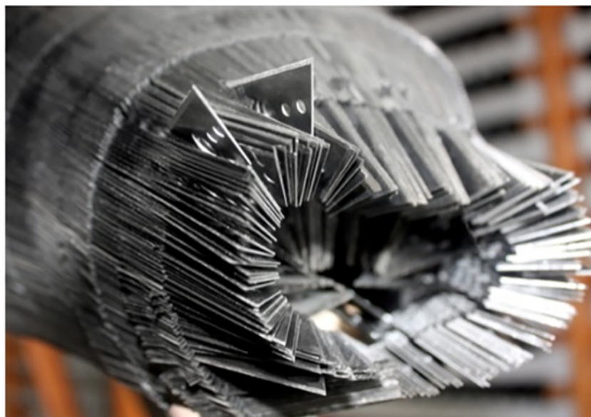
horse close up