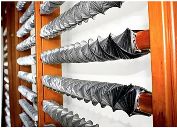
wall bars detail

Those failing to attend the exhibition must spend the rest of their day shamefacedly sporting their vests and pants. Possibly.