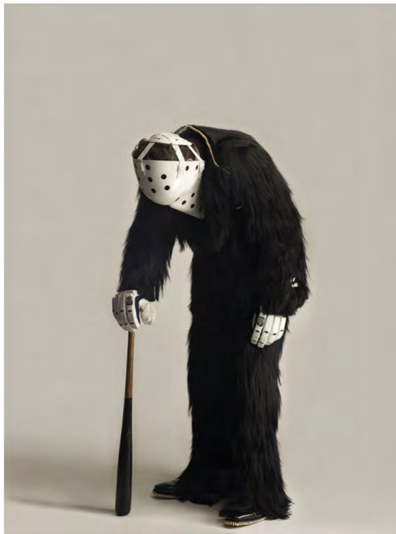
R. I. P. 2012.