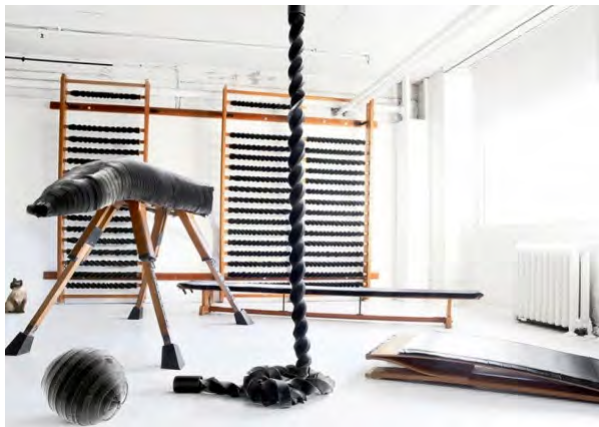
Double Games, Red In Tooth and Claw. Sculpture. 2009 - 2010

Their sculpture Double Games, Red In Tooth and Claw features 300,000 Stanley razor blades embedded in equipment commonly found in school gymnasiums therefore subverting its conventional purpose.