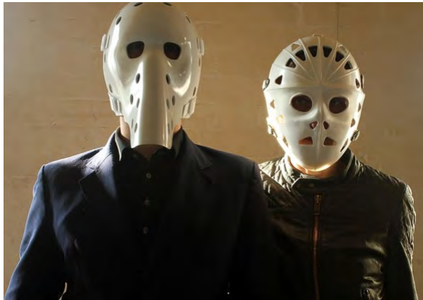
Self Portrait. 2012