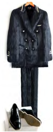
Apex Predator. Suit. Sculpture. 2011. Materials: Savile Row's Suit, human hair, glass eyes, dentures.