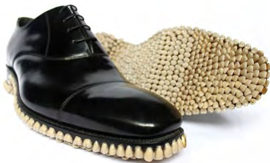
Apex Predator. Oxfords Shoes. Sculpture. 2010. Materials: Barker Oxfords Shoes, Size UK15, 1050 teeth dentures.