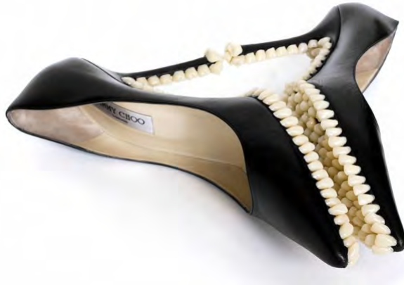
Apex Predator. Empire Shoes. Sculpture. 2012 Materials: Jimmi Choo Empire Shoes, Size UK6, 500 teeth dentures.