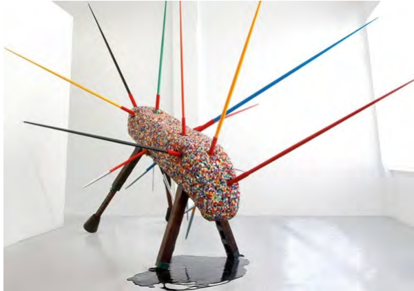
Mascot. Sculpture. 2012