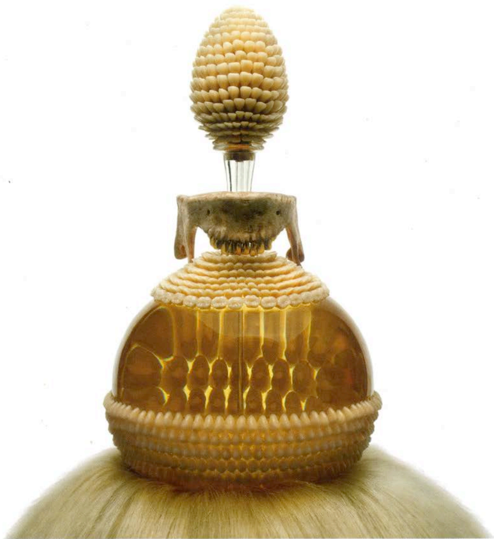
Fantich & Young Apex Predator I Alpha Scent Glass flask, teeth, human hair, and scent 36 x 20 x 20 cm £3,000